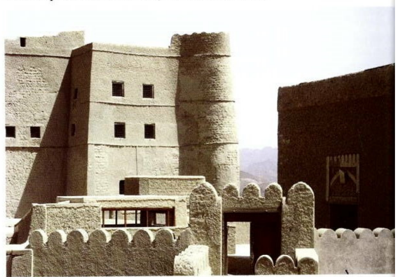
Bahla Fort, Oman.